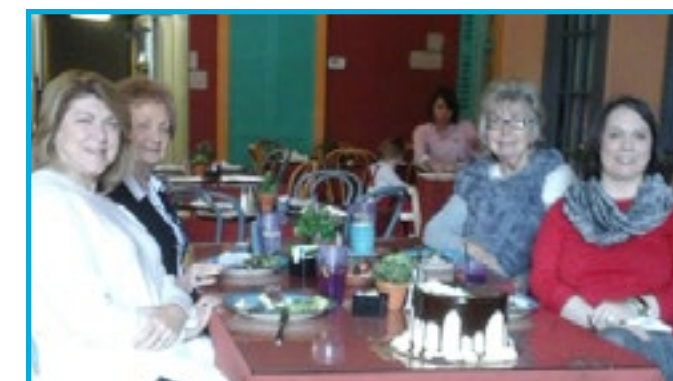
At Olexa's on Thursday, March 16

For the past few months, the FBC seniors have been "Discovering the Magic City!" In April, we are going to the Lyric Theatre and the Pizitz Building! We will leave the church at 9:00am and return to the church by 2:00pm. The cost is $10 plus the cost of lunch. We will be taking a 15-passenger bus with a center aisle. Sign up in the front office if you would like to attend.