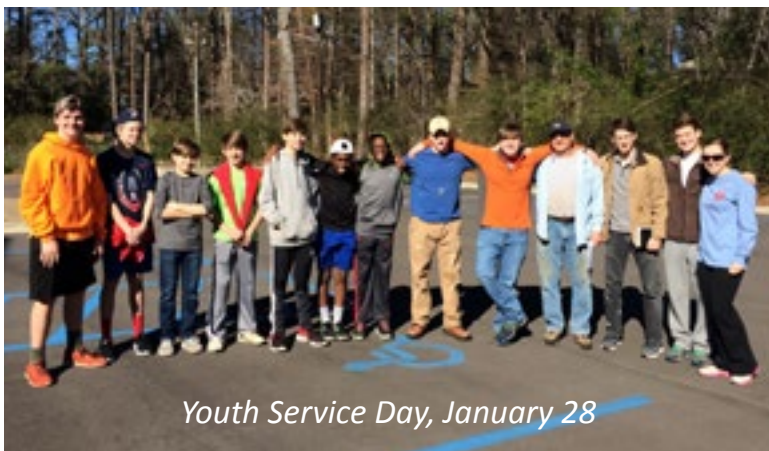
Youth Service Day, January 28